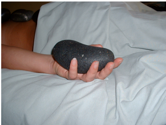
Rock Therapy is one of the many modalities students learn at Renaissance.

Students are required to wear the school shirt and long pants during clinic hours.