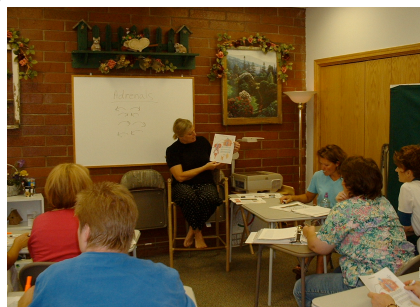
Visceral Course at Renaissance

(All instructors are under independent contract to instruct at Renaissance. Our staff can change each session. For a complete and current instructor list, please contact the office.)