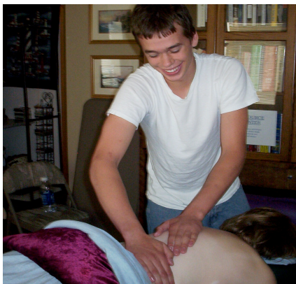
1st quarter student practicing Swedish Massage.

Renaissance College does not guarantee that students will pass the National Certification Exam for licensure. Our courses are designed to prepare student for licensure based upon the student's individual academic performance.