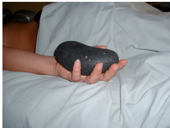
Rock Therapy is one of the many modalities students learn at Renaissance.

Students are required to wear the school shirt and long pants during clinic hours.