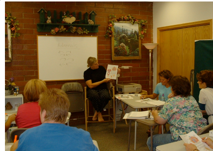
Visceral Course at Renaissance

(All instructors are under independent contract to instruct at Renaissance. Our staff can change each session. For a complete and current instructor list, please contact the office.)