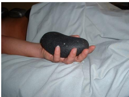
Rock Therapy is one of the many modalities' students learn at Renaissance.

Students are expected and required to conduct themselves professionally at all times. No tank tops or short shorts are allowed at school. Students are required to wear the school shirt and long pants during clinic hours.