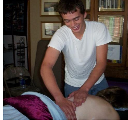
1st quarter student practicing Swedish Massage.

Renaissance College does not guarantee that students will pass the National Certification Exam for licensure. Our courses are designed to prepare student for licensure based upon the student's individual academic performance.